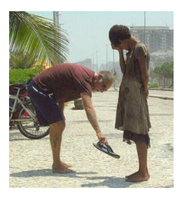
The man is giving his flip flops to the girl.