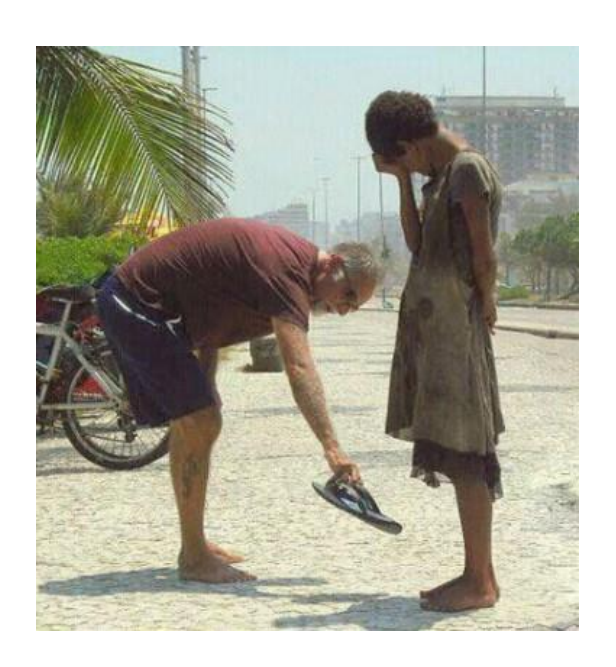
The man is giving his flip flops to the girl.